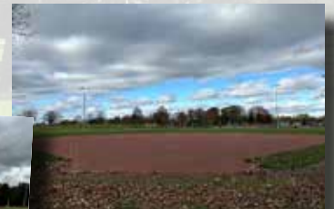
New Field #3