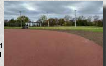
Lip removal of field #2

This softball field was removed and repurposed into a multipurpose football/soccer field with brand new LED lights and poles. Although we lost this field for softball, we have rebuilt Field #3. We will still have 3 beautiful updated fields to play on this coming Spring!