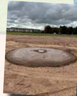
Mound blocks installed underneath batters boxes