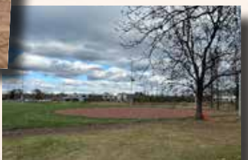
New Field #3