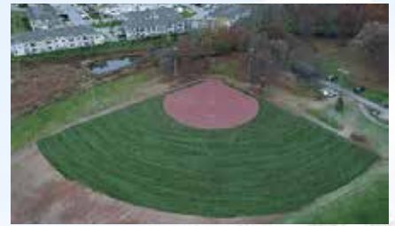
Drone view of new field #3